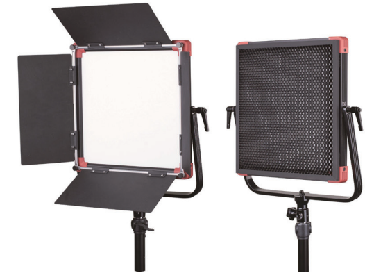
LA-HE60 4-leaf metal barn door