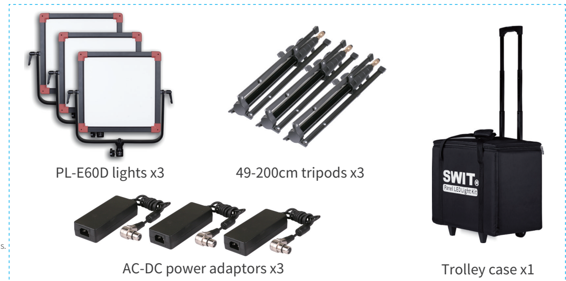
PL-E60D lights x3